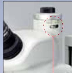
Optical path switching lever

The SMZ745T incorporates an optical path switching lever that enables easy switchover between eyepiece and camera. Nikon Digital Sight series camera can be attached.