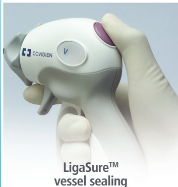
LigaSure™ vessel sealing